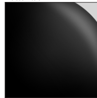
Matte Black - MBK